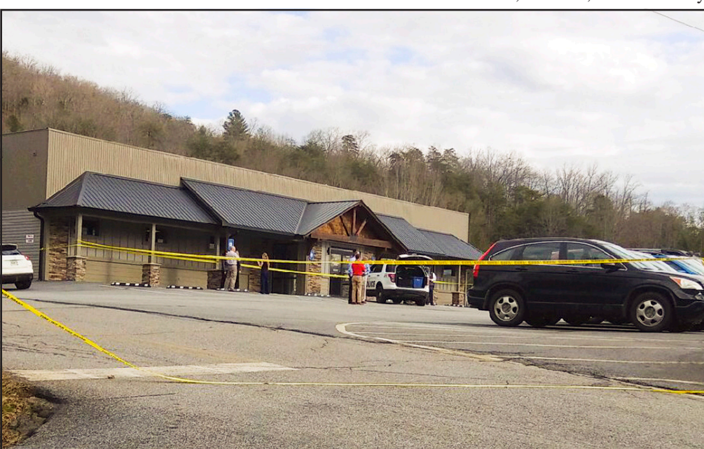
The Chatsuge Regional Hospital Rehabilitation & Wellness Center in Hiwassee was taped off by investigators following the Jan. 26 domestic-related shooting there.